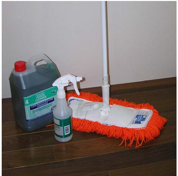
Antistatic mop and floor cleaning products.

On a monthly basis floors can also benefit from damp mopping. Providing the mop is only damp and the finish is in good condition, mopping carried out correctly will not affect either the finish or the timber. Damp mopping provides an effective deep clean and should be undertaken with a neutral pH wood floor cleaner or product recommended by the finish manufacturer. Harsh detergents or abrasive cleaners are to be avoided as are use of methylated spirits and vinegar as they can chemically attack some types of coatings e.g. waterborne polyurethanes and penetrating oils. After wetting the mop it should be wrung out until it is moist and the floor can be mopped in this condition. Using clean water, a final mopping with a mop wrung out till it is 'dry' may be used to further remove excess moisture on the boards.