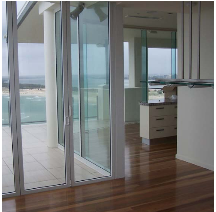
Timber floors are generally easy to maintain and greatly benefit from regular care.

Although a floor may be walked on after initial curing, some precautions are necessary with a newly finished floor until the coating system has fully hardened and this may take in the order of two weeks. Use of the floor before the full cure has been realised can result in increased tendency for scuffing and scratching. It is recommended that rugs are not laid until after the floor finish has fully hardened. Additionally rugs with rubber backings should never be used as these may tend to stain the applied coatings. While light furniture can be replaced and used during this period, it should be ensured that furniture protection felt pads are attached to the feet of tables and chairs etc and furniture such as chairs should be lifted. Similarly, it should also be ensured that heavy items such as fridges are moved carefully into position and at no time should they be dragged over either newly finished or fully cured floors. Consideration should also be given to chairs with castors as they can indent softer timbers and also cause premature wear of the coatings they are in contact with. Again these should not be used until the finish has hardened and barrel type castors are less likely to damage a floor than ball castors.