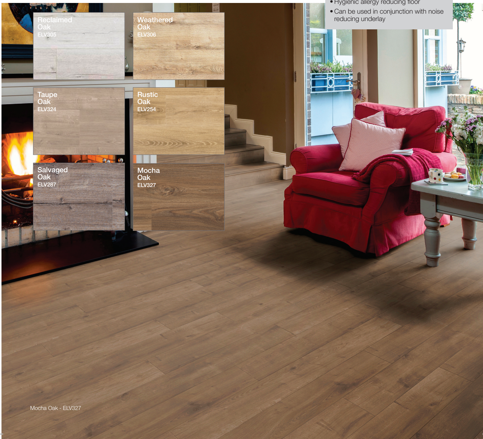
Mocha Oak - ELV327

The range features the superior Uniclic® tongue and groove click system. Its glue-free installation process makes it fast and easy to lay or re-lay your floor, meaning you can even take it with you if you move house. Each board locks together securely, ensuring a seamless joint that won't allow dust or dirt to gather. With the Uniclic® system, it means you can enjoy a quality installation for years to come.